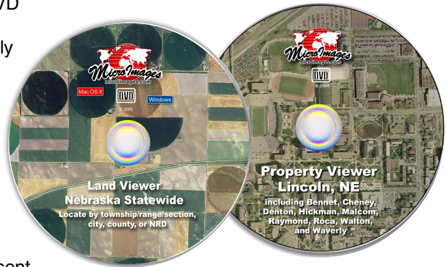
DVD-published atlases that autorun with custom tools